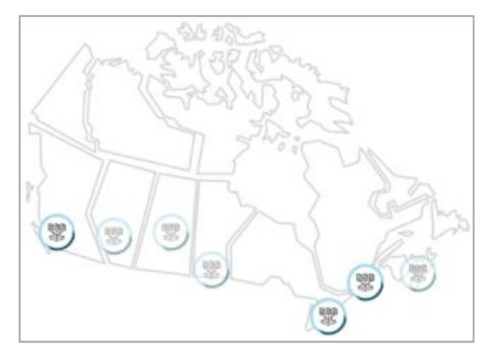
Figure 3: The bolded icons represent locations where CanDIG is deployed to ingest Network data. The additional icons show the locations identified for future deployment.